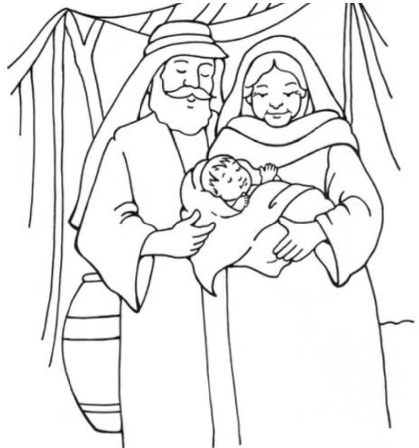
The Birth of Isaac