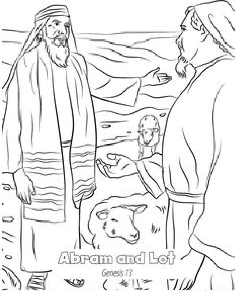
Abram and Lot

Children's Worship Bulletins | www.childrensbulletins.com