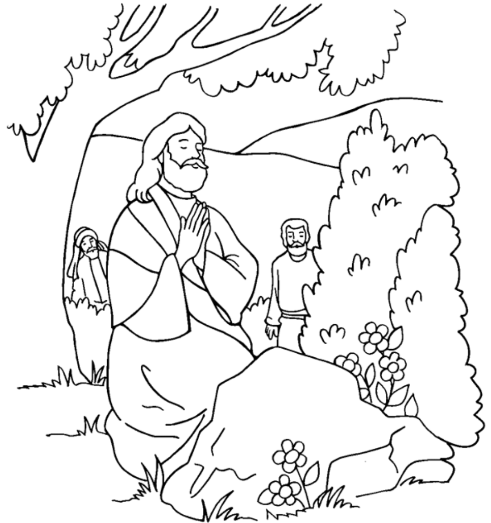
Jesus prays in the Garden of Gethsemane